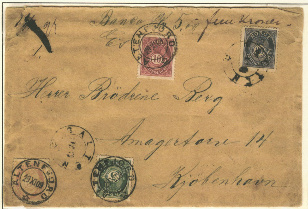
Money letter to Copenhagen (Denmark), franked with 20 øre post horn cancelled "GALTEN 29-11-09", insufficiently prepaid and therefore charged an additional 18 øre on board S/S Alten on one of its winter trips to Sørøya; surcharged stamps postmarked "ALTENFJORD 29-11-09". Postage paid: 10 øre (0-20g), registration 20 øre, insurance (0-150 kr) 8 øre = in total 38 øre

From 1907 to 1909, the ship in the Altenfjord route made an extra trip to the outermost fishing villages of Sørøya in West Finmark every fortnight in the winter months