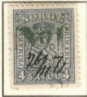
"Nor" in blue and manuscript "26-11-71"

The type 1 handstamp is known in blue (1871-72) and black (1875-76) strokes