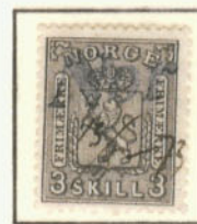
"Nor" forgery in pale blue and "13-2-73" in manuscript