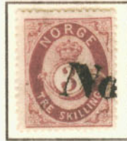
"No(r)" in black