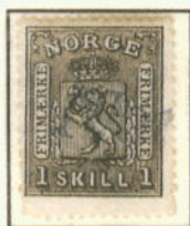
"Nor" forgery in pale blue

In the early 1990'ies a few copies of a newly designed forgery, resembling the type 1 handstamp, turned up in the market