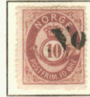
"No(r)" in black