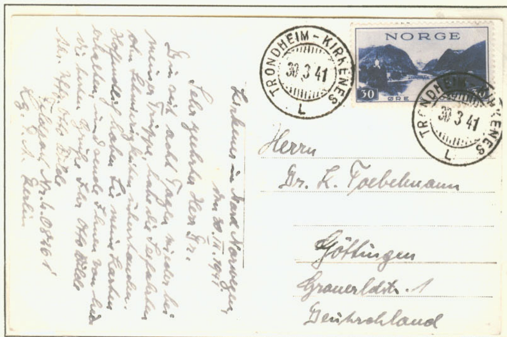
Post card from German soldier in Finmark [feldpost Nr. G 08261 in Kirkenes] to Göttingen in Germany; illegally dispatched via the Norwegian civil mail and franked with NK 232 (30øre), sent with "Hurtigruta" southwards and cancelled "TRONDHEIM-KIRKENES L 30-3-41"