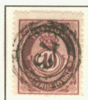
"73" (NK 43)