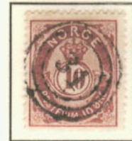
"31" (NK 43)