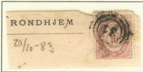
"31" (NK 38) on letter piece

S/S Præsident Christie sailed in the route from 1875 to 1885. From May 1883 until May 1885, the ship used a 3-ring numeral canceller "31" to cancel mail handed in on board