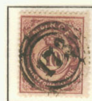
"173" (NK 43)