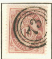
"73" (NK 38)

S/S Jonas Lie and S/S Ole Bull sailed in the route from 1875 to 1886. From May 1883 until December 1886 they used the 3-ring numeral cancellers "73" and "173" respectively, to cancel mail handed in on board