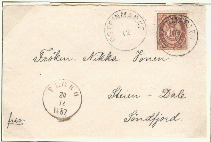
Domestic single-weight letter (10 øre) of December 24, 1887, from Vardø in Finmark to Søndfjord in Western Norway, with origin ship postmark "ØSTFINMARKEN", transit postmarked "FLORØ" on Dec. 24