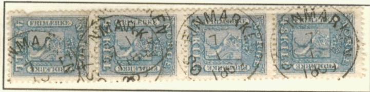
"ØSTFINMARKEN 7-1-1869" 4 Sk Coat of Arms II stripe of four postmarked on board "Nidelven" on 1st westbound trip in 1869

In 1869 the Eastern Finmarken route was passed over to the private steamship companies Det Bergenske Dampskibsselskab (BDS) and Det Nordenfjeldske Dampskibsselskab (NFDS). In the first years S/S Nidelven and S/S Nordstjernen alternated in the route. A circular dated handstamp with text "ØSTFINMARKEN" was used on board from the very first sailing in January 1869