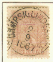
"DAMPSK:LINDESNÆS 2-9-1867" 25th westbound trip