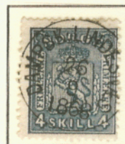
"DAMPSK:LINDESNÆS 26-9-1868" 28th westbound trip