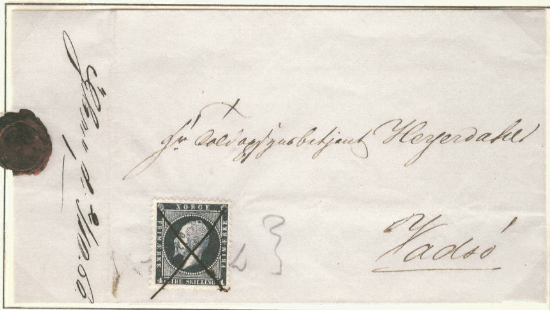
Cover of October 2, 1860, posted on board S/S Gler and inscribed "Gler 2-10-60" in pen manuscript; postage stamp (NK 4) cancelled with ink cross, sent to Vadsø

S/S Gler sailed in the Eastern Finmarken route from 1856 to 1863. The postal clerksman alternatively used ink cross or dated or undated pen manuscript of the ships name to cancel letters handed in on board