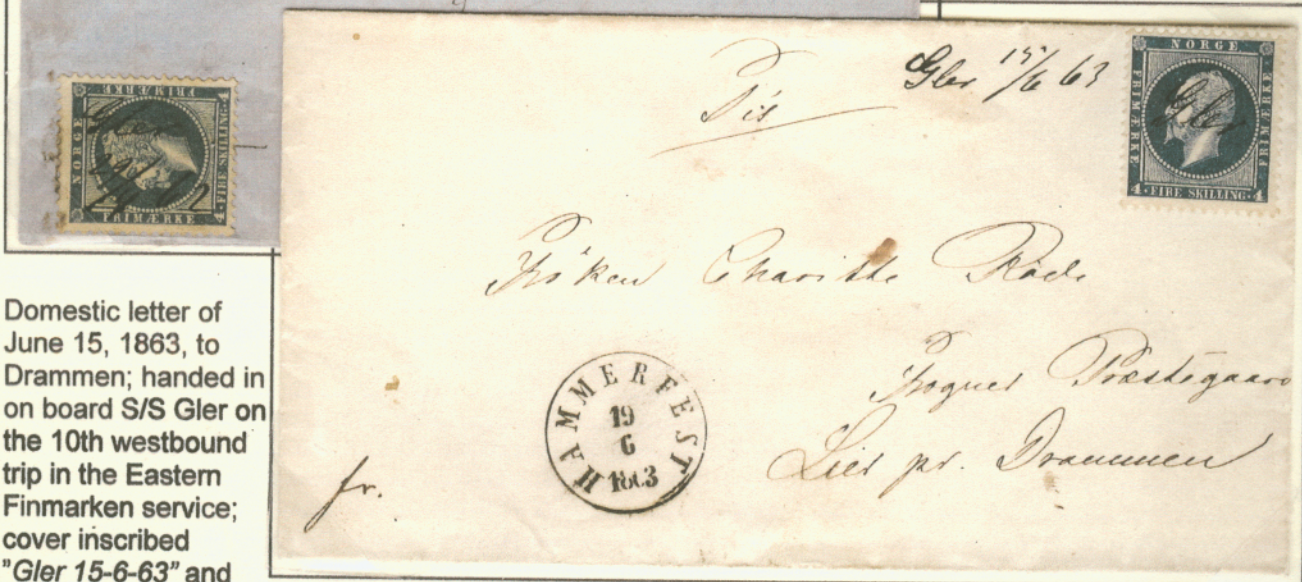
Domestic letter of June 15, 1863, to Drammen; handed in on board S/S Gler on the 10th westbound trip in the Eastern Finmarken service; cover inscribed "Gler 15-6-63" and

postage stamp (NK 4) cancelled with the ship's name "Gler" in pen manuscript; in Hammerfest transit postmarked "HAMMERFEST" on June 19; sent southwards with the coastal steamship S/S Æger in the Nordland line on the 17th southbound trip from Hammerfest