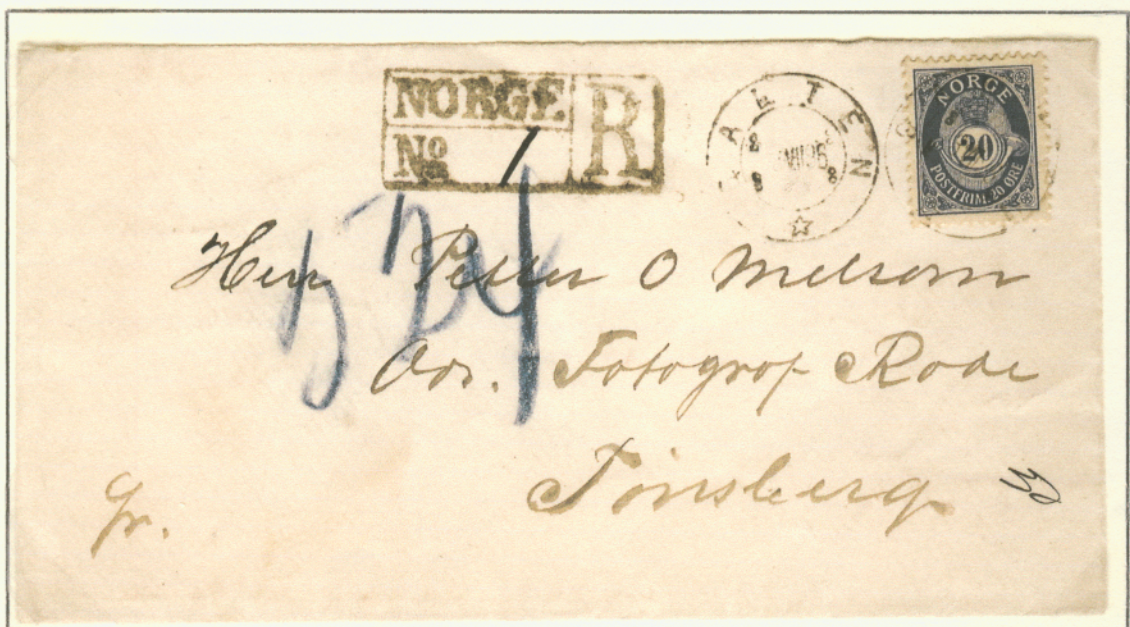
Registered letter (envelope) franked with 20 øre post horn (NK 58B) cancelled "GALTEN" (type 1) on July 3, 1896; cover stamped with rectangular R (registered) postmark (type IA); sent to Tønsberg.

Postage rate: 10 øre for single-weight (<15g) letter, plus registration 10 øre = 20 øre [from 1-1-1877 to 1-7-1917]