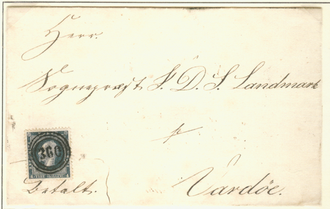
Local letter from Maasø to Vardø franked with 4 Sk Oscar postmarked with 3-ring numeral "360"

Maasø post office was one of the very first post offices in Finmark, established back in 1778 when Maasø was a calling place for the boatpost expresse sailing along the coast of Finmark. The post office was later laid down, but re-appeared in 1856 when a branch mail service was set up from Hammerfest to Maasø to Gjøsvær to Skarsvaag in the winter season. The post office got a numeral canceller "360" in autumn 1856 and a 1-ring circular date-stamp in 1859