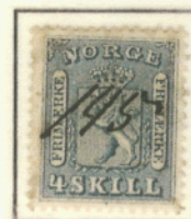
"145" 4 Sk Coat of Arms II