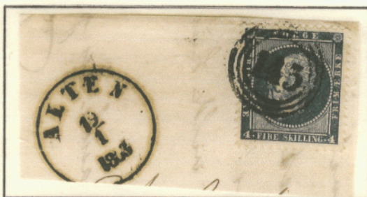
Letter piece with 4 Sk Oscar cancelled with numeral "145" and transit postmarked "ALLEN 12-1-1863" (type 2)