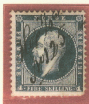
"Hop 7-6-61" and "No. 125" in manuscript on 4 Sk Oscar only registered copy of combined use of numeral and local name of post office