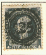
"125" 4 Sk Oscar