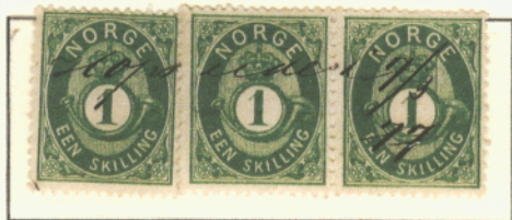
"Hopseidet 7-3-77" 1 Sk post horn x 3 on piece of letter