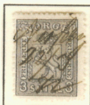
3 Sk Coat of Arms III "Nesseby 22-3-72"