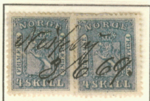
4 Sk Coat of Arms II x 2 "Nesseby 3-6-69."