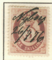
3 Sk post horn "Nyborg 26-7-76"