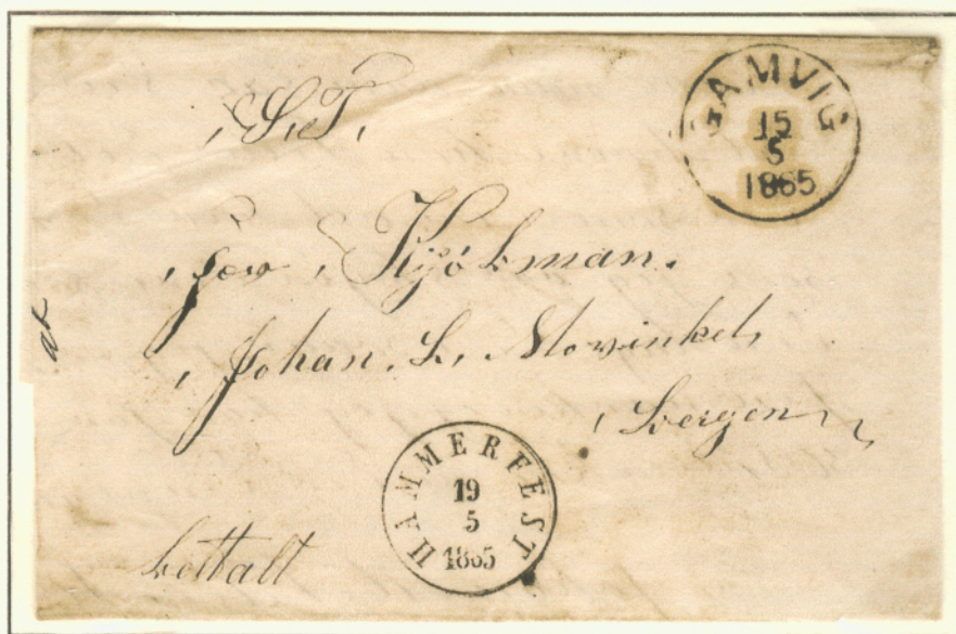
Local, prepaid letter of May 15, 1865, from Gamvig to Bergen; with origin postmark "GAMVIG", sent by the Eastern Finmarken service to Hammerfest; transit-marked "HAMMERFEST" on May 19; with the Nordland line southwards from Hammerfest to Bergen

Only registered preadhesive letter with "Gamvig" manuscript cancellation