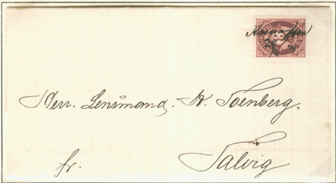
Local letter of April 24, 1874, franked with 3 Sk posthorn, from Komagfjord to Talvig in Alten, with postal manuscript "Komagfjord 24-4-74"