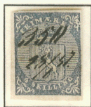
"350" 28/1-57." 4 Sk Coat of Arms I