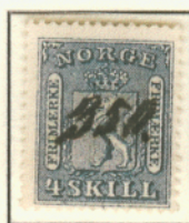
"350." 4 Sk Coat of Arms II