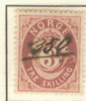
"350." 3 Sk post horn

The sub-postmaster Jens Nicolay Kraft Buck at the class 3 post office in Komagfjord used the name of the post office, or the numeral "157", or a combination of the two, written with pen on the postage stamp affixed to the letter. A datestamp was not delivered until 1876