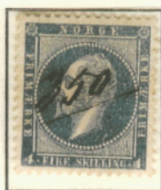
"350" 4 Sk Oscar