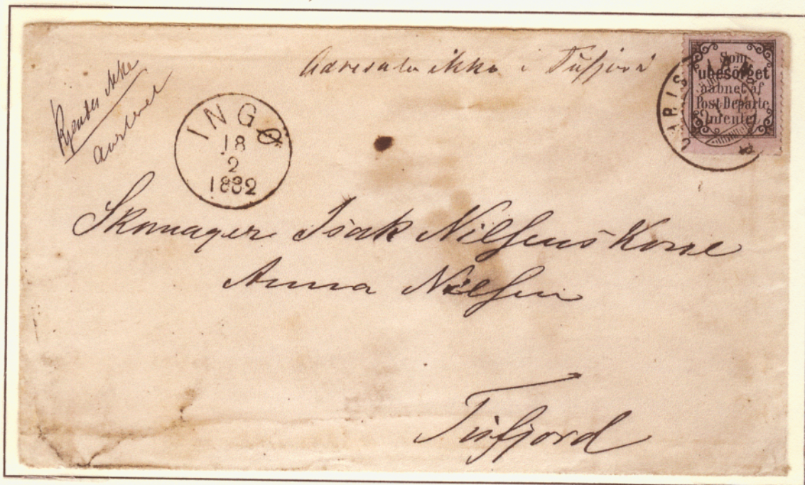
Undelivered domestic letter opened by the General post administration in Christiania, enclosed in new envelope affixed returned letter stamp (NK R 1y) postmarked "CHRISTIANIA" on January 12, 1882 and returned to the presumed sender in Tufford in Finmark. In Tufford, cover inscribed "recipient not in Tufford" in manuscript and letter forwarded with the branch mail service from Rolvsøhamn to Ingø; here inscribed "sender not known" and postmarked "INGØ" (cds) on February 18

"A boatpost expresse sails from Rolvsøhamn to Ingø each time post arrives at Rolfsø (Tufford) from Hammerfest on the eastward trip with the coastal steamship (Royal Resolution of October 12th 1861)