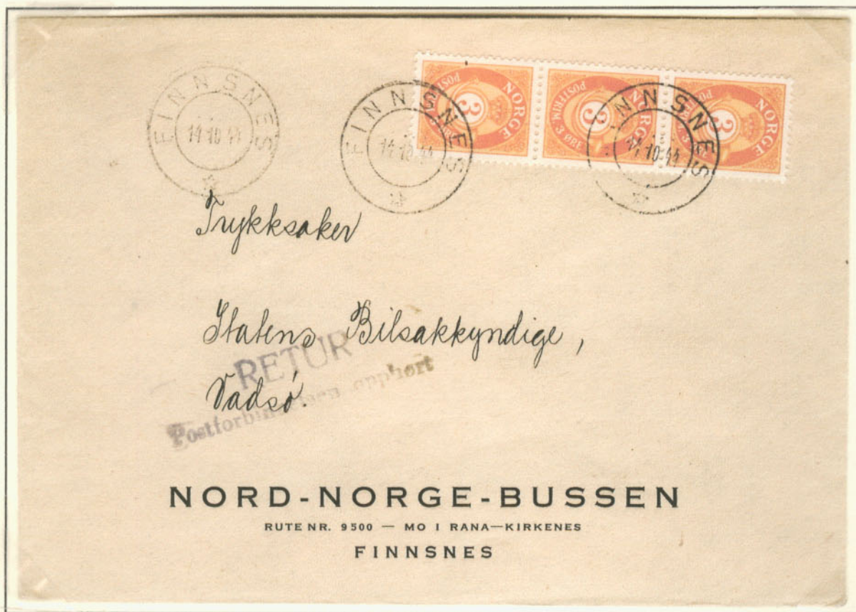
Domestic letter (printed paper) (9 øre; overpaid with 2 øre) postmarked "FINNSNES 14-10-44", addressed to Vadsø; postal conveyance blocked and letter stamped with blue rubber stamp "RETUR Postforbinnelsen opphørt" at Tromsø p. o. Postage rate : 7 øre for printed paper [from 1-7-1929 to 1-10-1946]