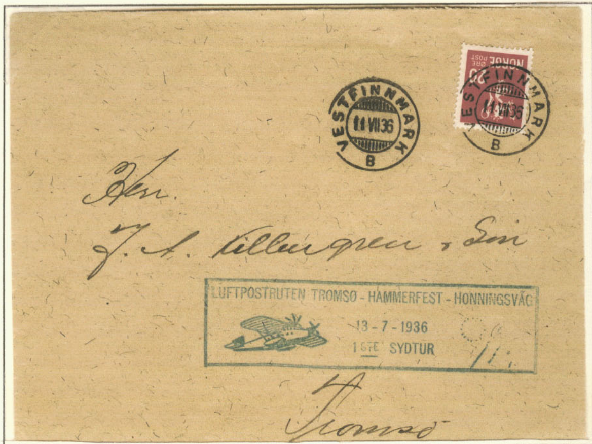
Domestic letter posted on board S/S Brynilen in FARs route no 2A to Hammerfest and postmarked "VESTFINNMARK B 11-7-36"; sent southwards by airmail next day to Tromsø and postmarked "LUFTPOST-RUTEN TROMSØ-HAMMERFEST-HONNINGSVÅG - 13-7-1936 - 1ste SYDTUR"