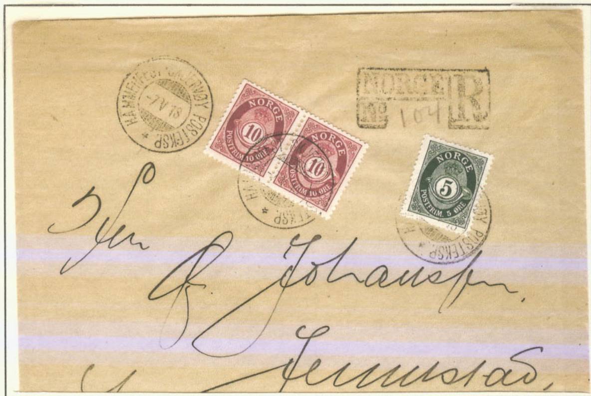
Registered letter (25 øre) postmarked "HAMMERFEST-SKJERVØY POSTEKSP. 7-5-18", with rectangular R (registered) postmark (type 3). Postage rate : 10 øre for single-weight letter (0-20g), plus registration 15 øre = 25 øre [from 1-7-1917 to 1-1-1921]